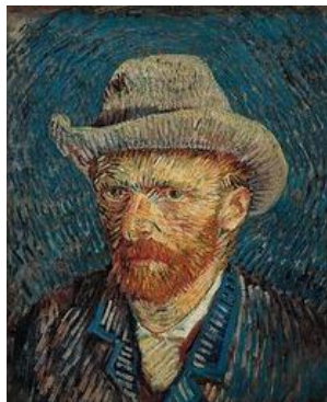
Van Gogh Museum Vincent van Gogh Self-portrait