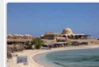
Red Sea Marsa Shagra Marsa Alem, Egypt