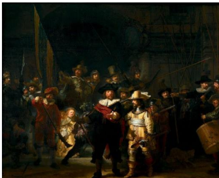
Rijksmuseum Rembrandt van Rijn The "Nachtwacht"