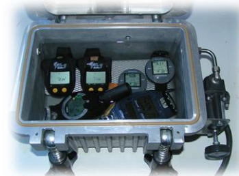
Examination of dive computers, SDR