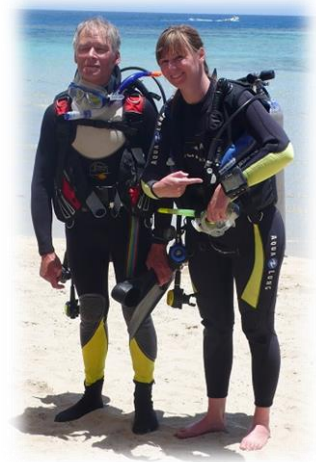
Subjects, Marsa Sagra,

Receipts will NOT be provided: use your registration confirmation or bank transcription.