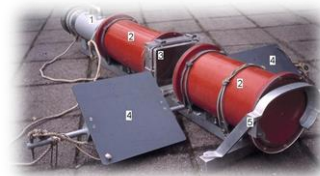
Visual research in OW, SDR

10.05-10.45 Nico A.M. Schellart Half a century research by Stichting Duik Research Construction and exploitation of a monoplace chamber, visual research in open water, examination of the performance of dive computers, open sea and dive simulation studies with Doppler bubble detection and spirometer, 10 years Capita Selecta Diving Medicine.