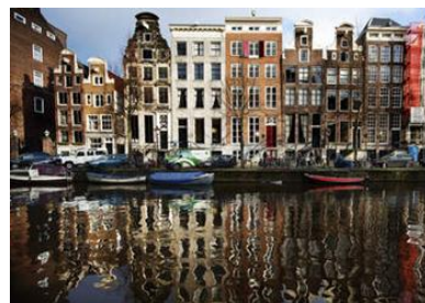
The Amsterdam Canals